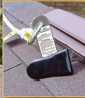
Exterior rooftop application